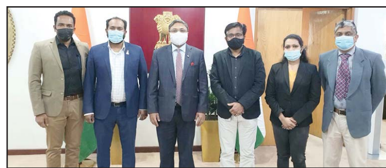
A photo from the event.

This agreement commenced in the spring of 2021. To accommodate further collaborations, the contract will be evaluated and reviewed on a biennial basis.