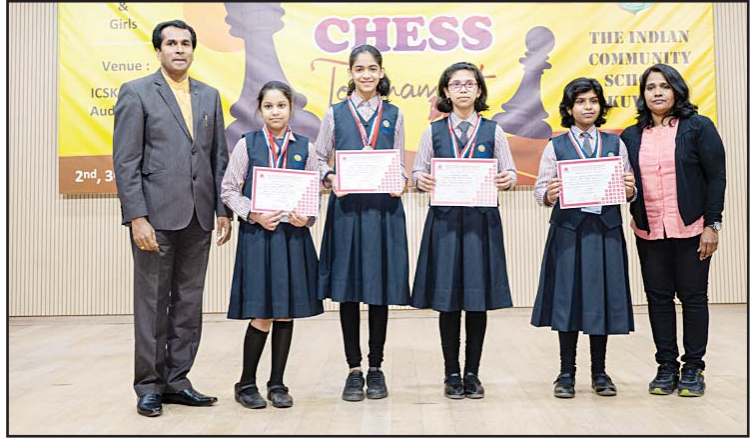
Some of the schools at the tournament.