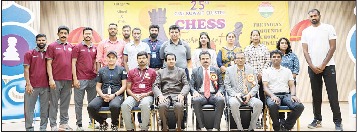
Photos from the event.

innovators and change-makers in digitalization and innovation, providing a stepping stone for their future career prospects.