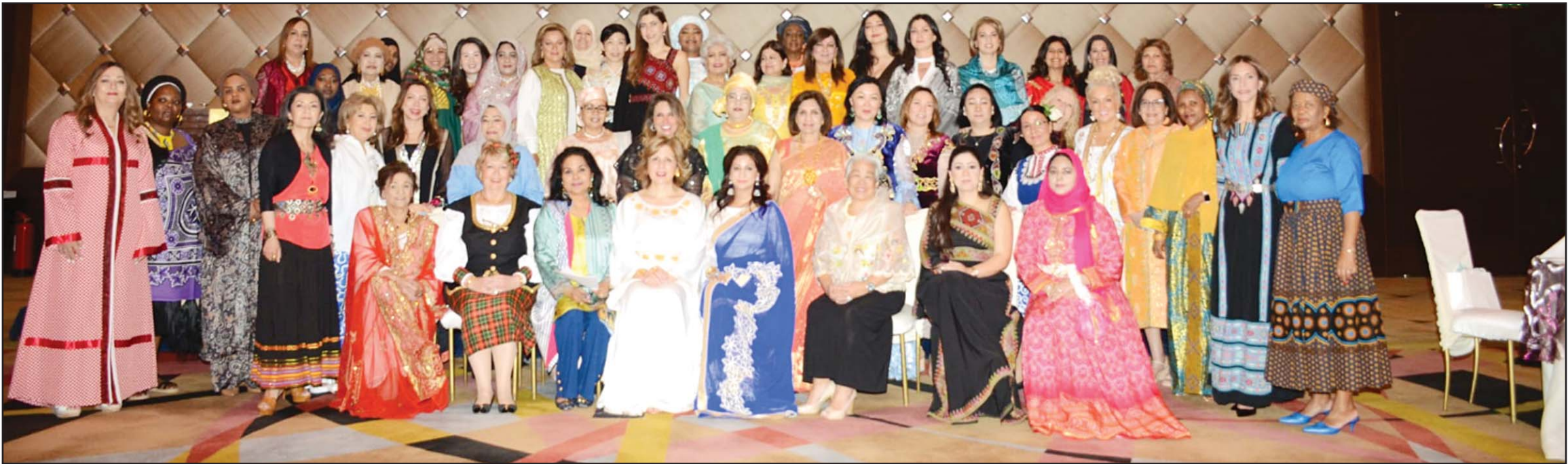
A group photo from the event.

KUWAIT CITY, May 13: The International Women’s Group Kuwait (IWG) held a mesmerizing event celebrating “IWG Member’s Day” on Sunday, May 7 at the Crowne Plaza Hotel, Farwaniya.