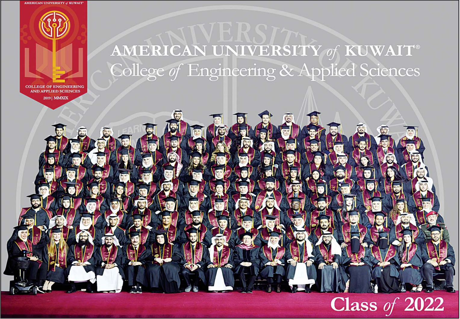
Class Photo: College of Engineering and Applied Sciences (CEAS)