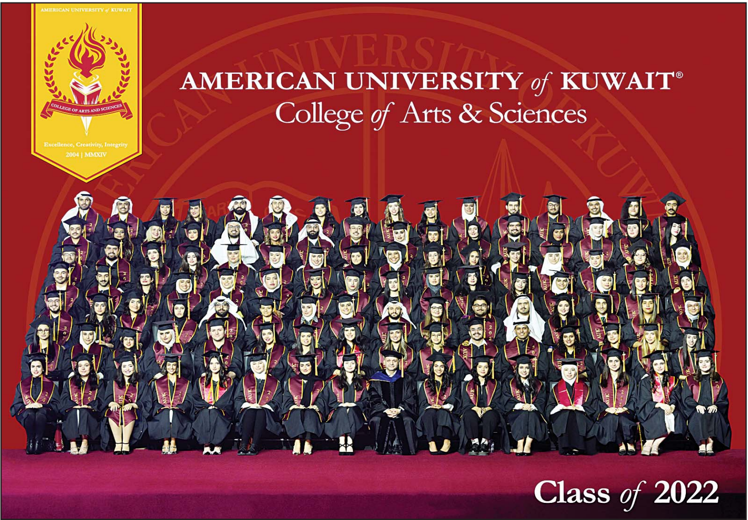
Class Photo: College of Arts & Sciences (CAS)