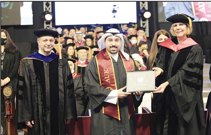
College of Arts & Sciences (CAS) diploma presentations by AUK President and Dean of CAS