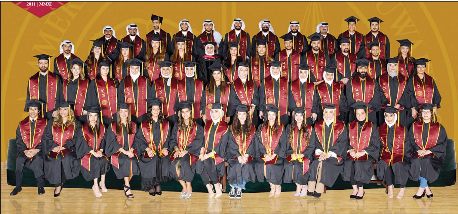
College of Business & Economics (CBE) Class of 2021