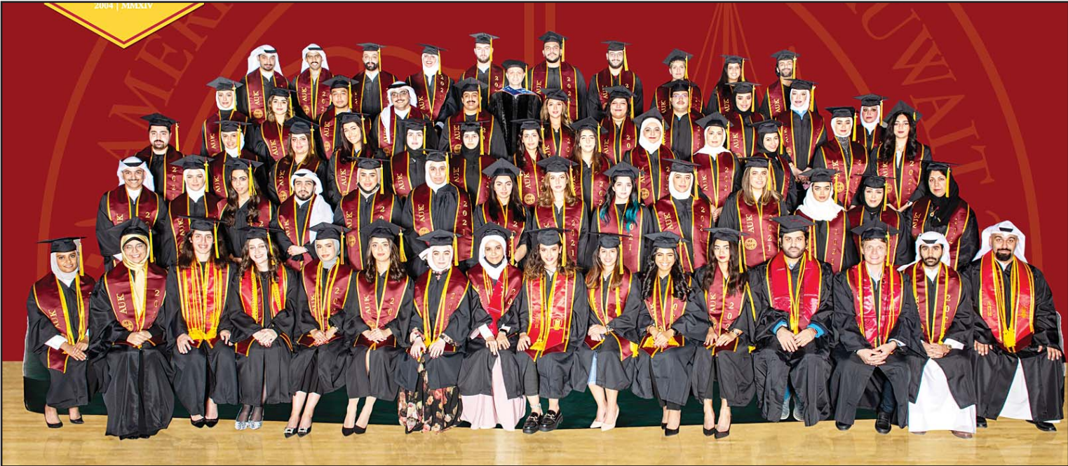
College of Arts & Sciences (CAS) Class of 2021 photo