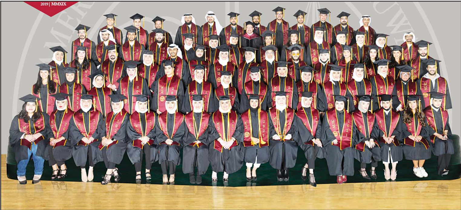
College of Engineering and Applied Sciences (CEAS) Class of 2021