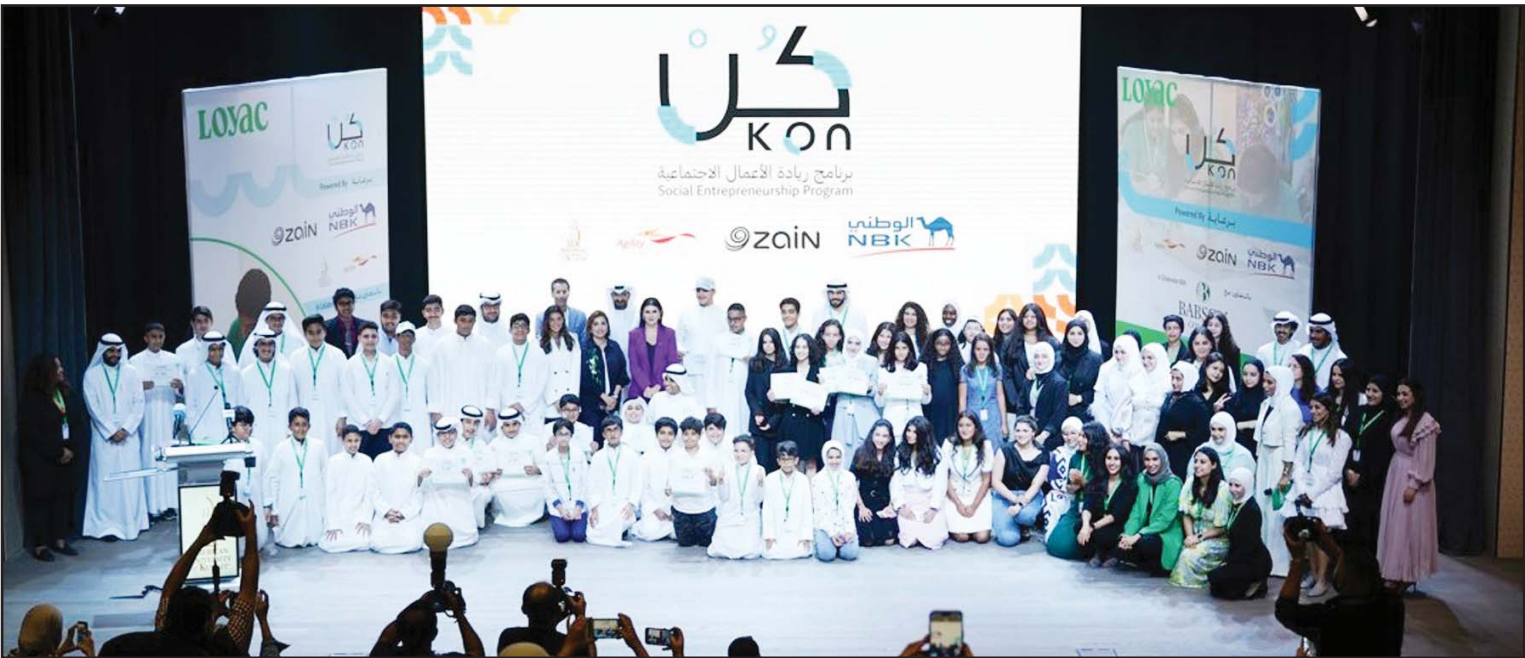
Group photo during the closing ceremony.