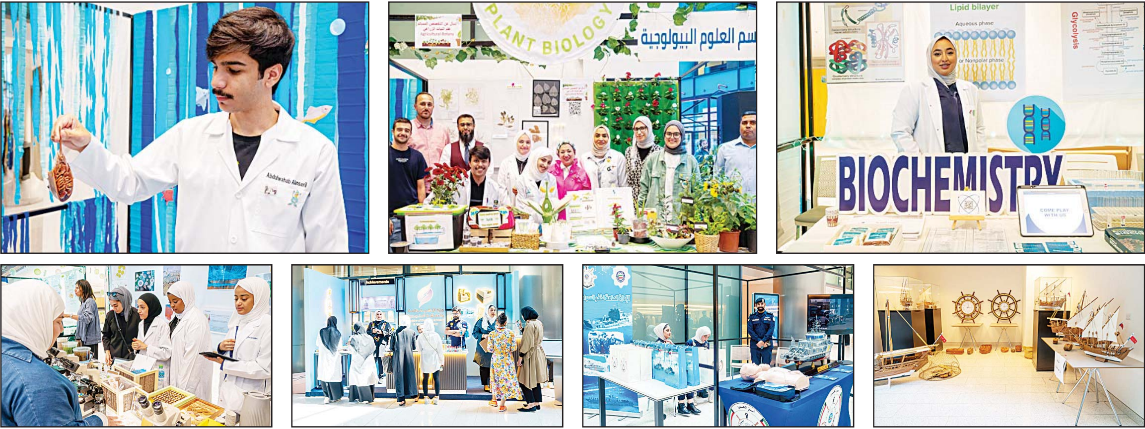
Kuwait University opens 'Science Expo 2023' with local and international participation.