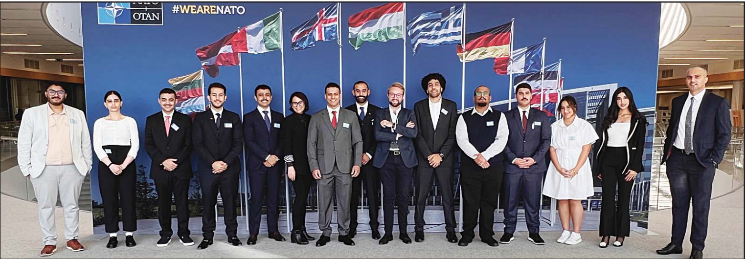
American University of Kuwait students pose for a group photo at the NATO Headquarters.