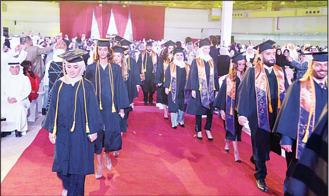
Faculty and Student processions

KUWAIT CITY, June 9: AUK held its annual graduation commencement for the Class of 2018 on Thursday 7th of June where 424 students – 269 from the College of Arts and Sciences, and 155 from the College of Business and Economics – officially became AUK graduates, amongst whom were 7 graduates with highest honors, 19 with high honors, and 20 with honors. The ceremony was held under the patronage of His Excellency