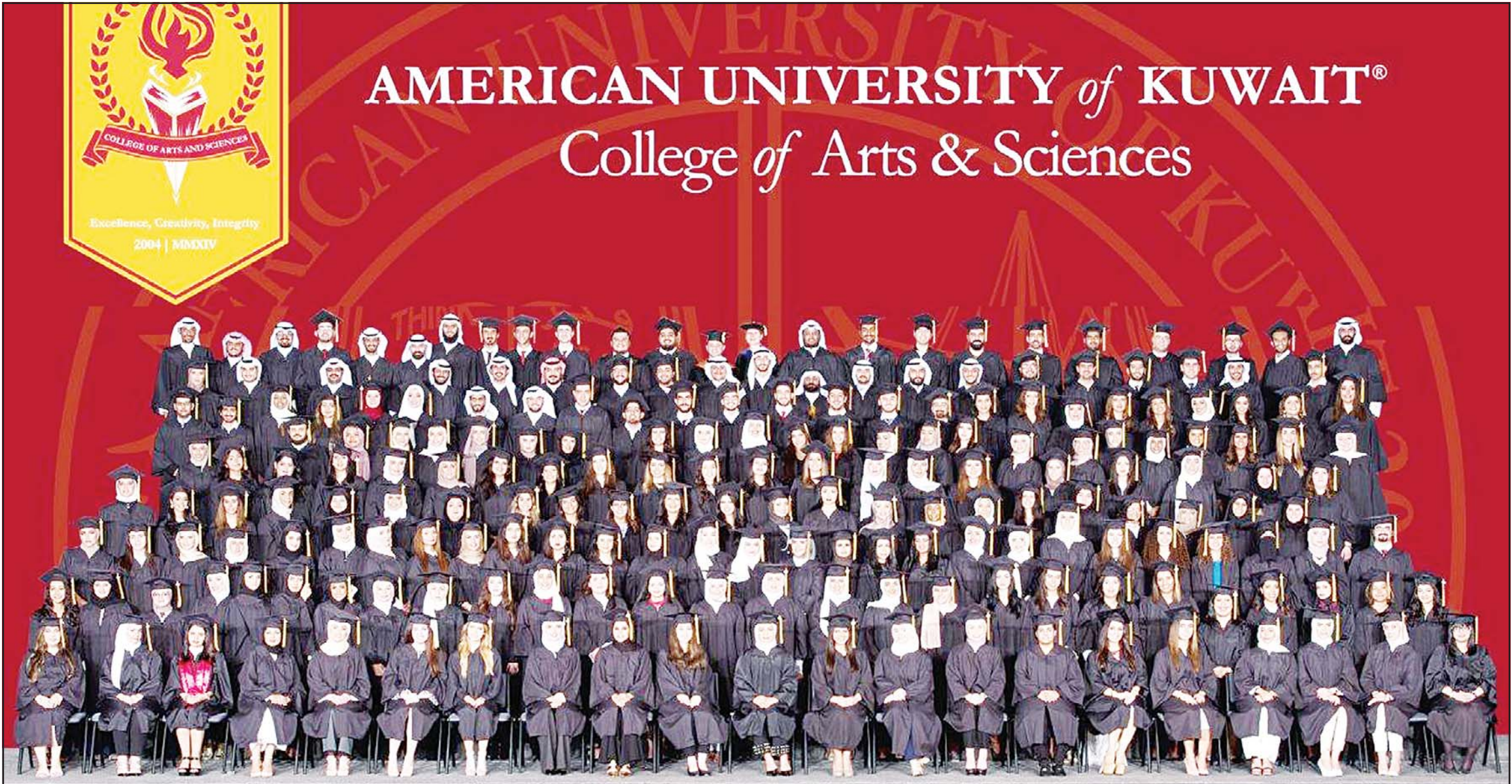
Class photo: College of Arts & Sciences