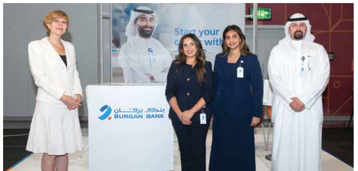
KUWAIT: Officials pose for a photo in front of the Burgan Bank booth at the annual career fair hosted by the American University of Kuwait.

environment and employment journey in a way that responds to talents' evolving needs."