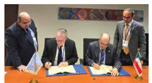
WASHINGTON: KFAED's Acting Director General Waleed Al-Bahar and Director of the UNDP Regional Bureau for Arab States Abdallah Al-Dardari sign agreements to provide clean water to Gaza and Sudan on Friday April 25, 2025. — KUNA

The number of direct beneficiaries from the project is estimated at approximately 250,000 residents of the Gaza Strip, the majority of whom are women and children. The fund also signed a $2 million grant with UNDP to support a project aimed at enhancing access to drinking water infrastructure for displaced persons, refugees and host communities in Sudan. The project aims to increase access to safe and reliable water for approximately 500,000 individuals, including internally displaced persons (IDPs), refugees, returnees, and residents of 24 host communities that house the highest concentration of IDPs. The project also aims to ensure the availability of environmentally friendly water infrastructure, promote equitable, fair, and peaceful access to water for all, and strengthen local capacities for sustainable service delivery.