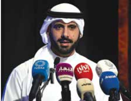
Sheikh Mubarak Fahad Al-Jaber Al-Sabah