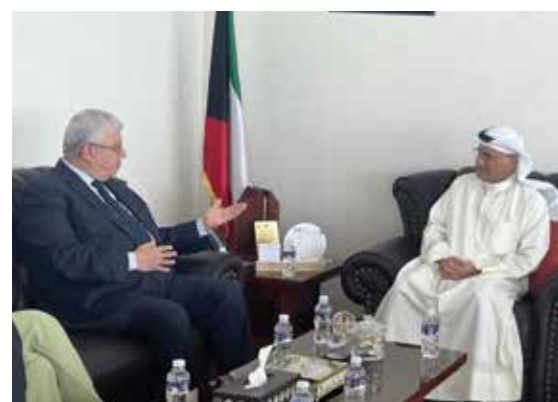
KUWAIT: Kuwait's Minister of Higher Education and Scientific Research Dr Nader Al-Jallal meets with his Egyptian counterpart Dr Ayman Ashour.

Established in 2016, the EKB has become a key pillar of Egypt's education system, providing free