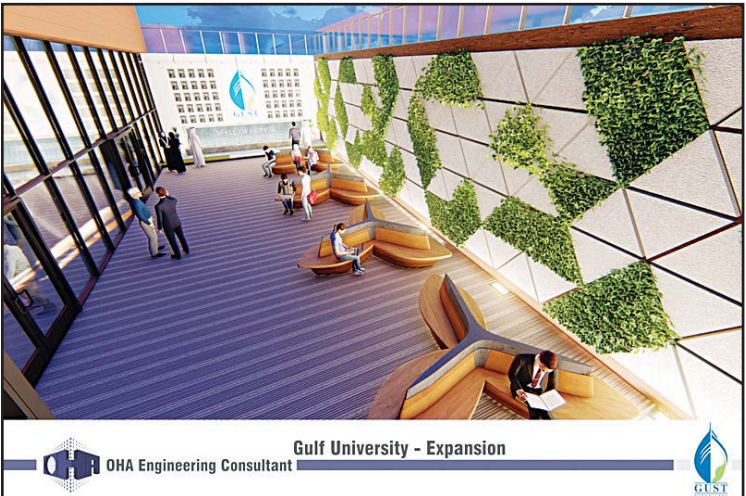
Graphic picture of the part of building to be constructed.