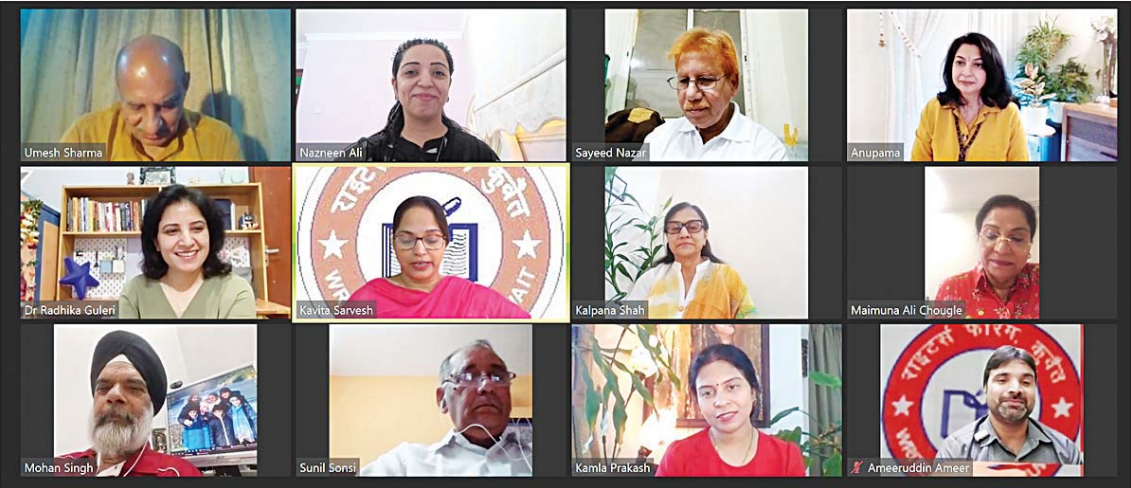
Writers' Forum Kuwait members photo from the virtual meeting.

Science Po is a renowned research university specialized in the field of humanities and social sciences based in Paris, and KFAS is a Kuwaiti private non-profit organization that aims to support progress and advancing sciences and technology. Working together, the two institutions - through the Sciences Po's Kuwait Program - support a range of initiatives in the fields of research, teaching, and academic events, with special emphasis on studying the Middle East and Gulf region. The AUK Department of International Relations continues to support student learning inside and outside the classroom by offering discussions of regional and local issues.