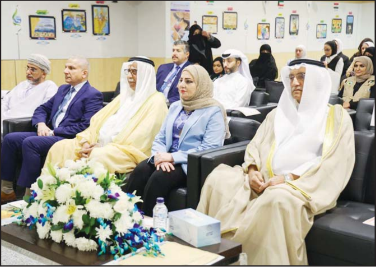
KUNA photos of Regional Organization for Protection of Marine Environment's event attendees.