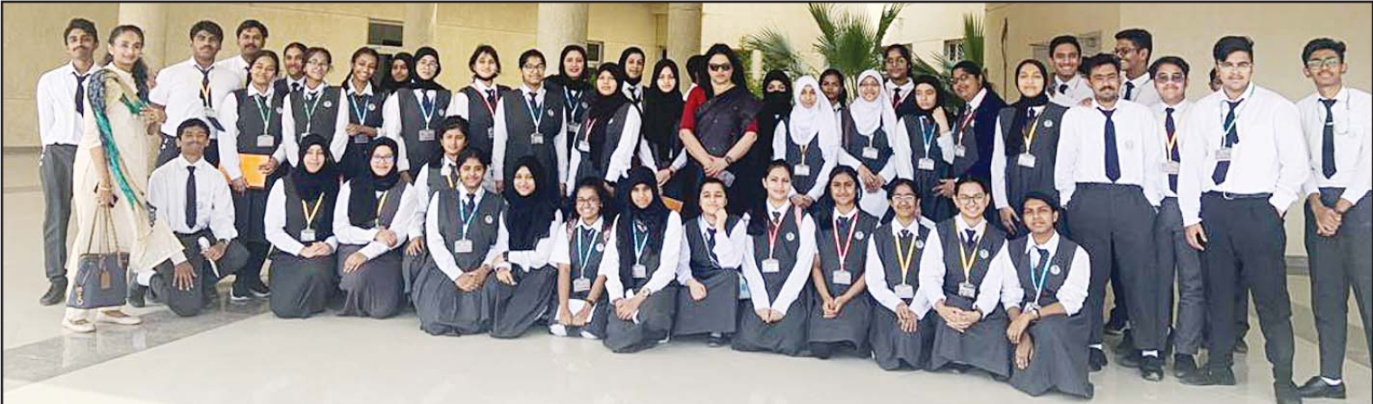
Class XII Biology students of Indian Public School visit Kuwait Medical Genetic Centre

KUWAIT CITY, May 9, (KUNA): The Regional Organization for Protection of Marine Environment (ROPME) on Monday celebrated the Regional Environment Day, coinciding with the 1978 treaty according to which the organization was founded. ROPME's Acting Director General Samira Al-Kandari, in a statement on behalf of the Deputy Prime Minister, Minister of Oil and Minister of State for National Assembly Affairs Bader Al-Mulla, underscored the need to educate the youth namely the students about negative impact