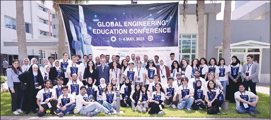
EDUCON 2023 group photo of AUK student volunteers.