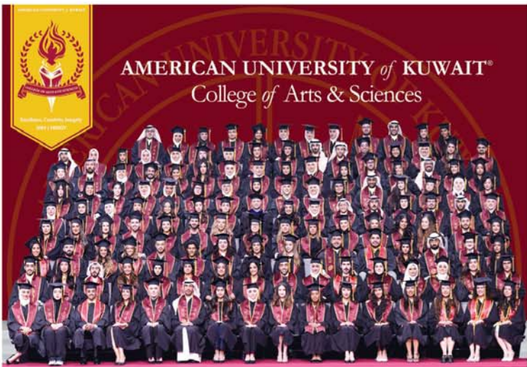
Class of 2023