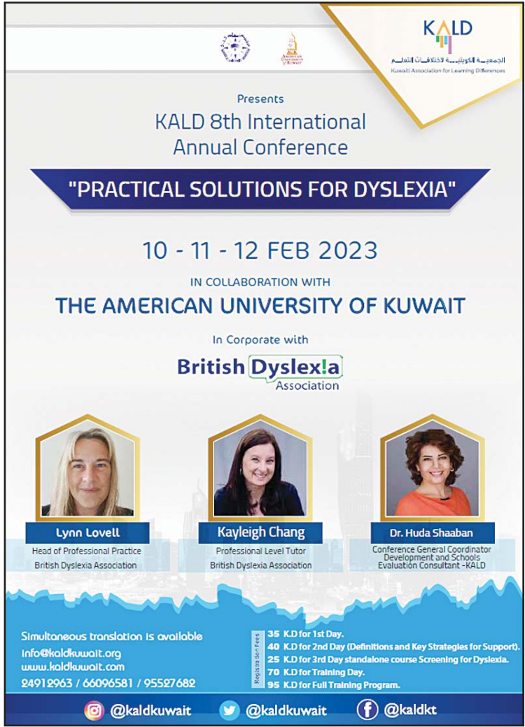
Flyer of the event.