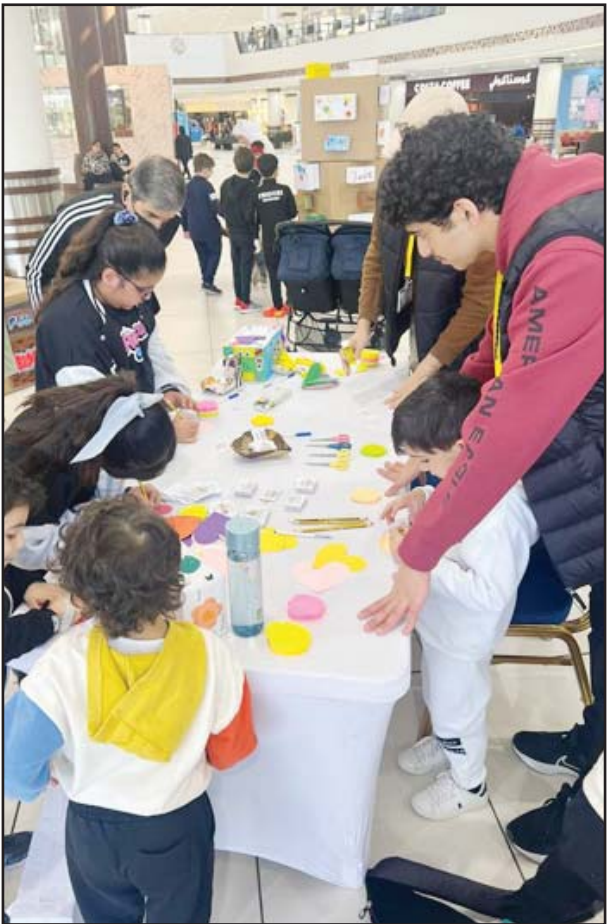
Photos from the event