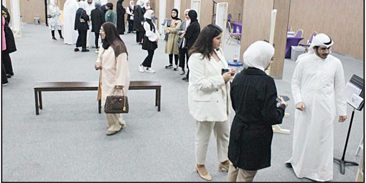
Exhibition held at BSK campus.