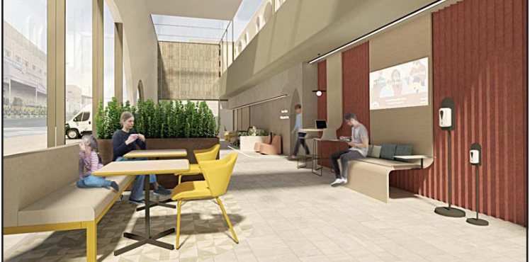
Rendered interior solution by Interior Architecture student Raghad Al-Mulla