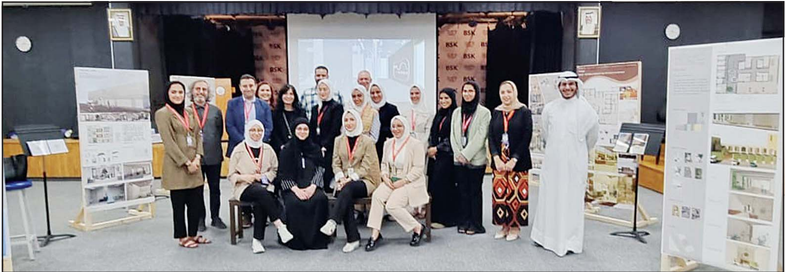
A group photograph including the collaborative team members