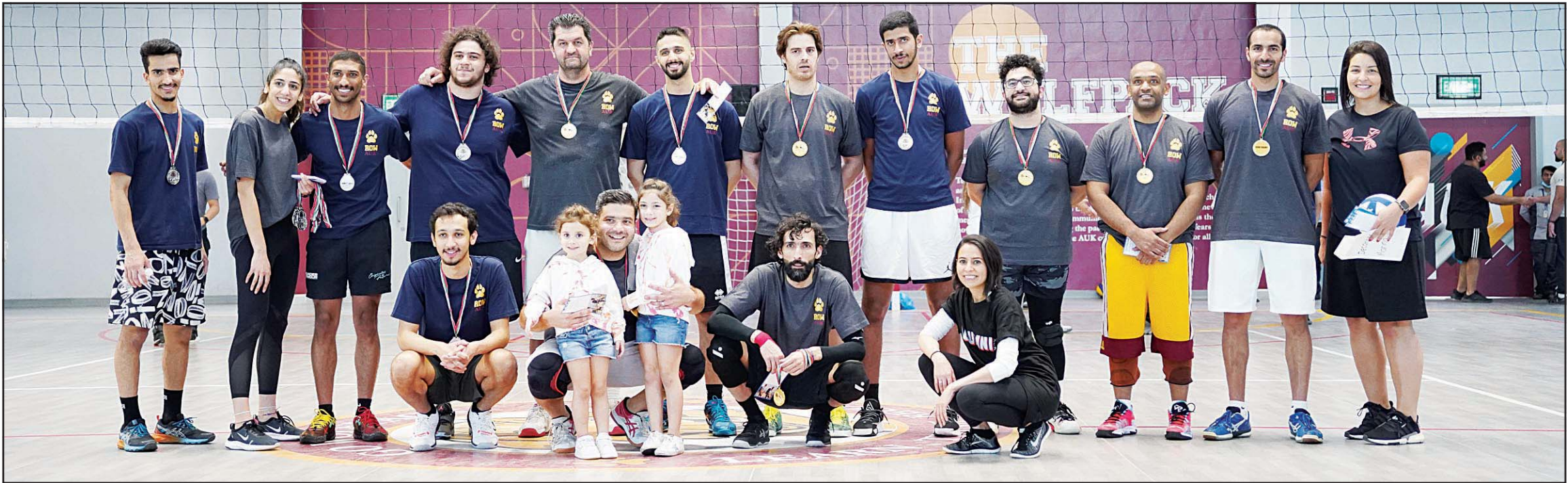
A photo from AUK's Return of the Wolf Pack event.

The American University of Kuwait (AUK) hosted its first large-scale athletic event, Return of the Wolf Pack (ROW), after a two-year hiatus due to COVID-19 restrictions. The full-day event was organized by the Office of Alumni Affairs & Career Development (AACD) whereby alumni and student athletes competed against each other in the following sports: volleyball, basketball, futsal, and padel—all of which were won by the alumni teams. This year's ROW saw the greatest number of athletes and spectators including 120 athletes and over 200 spectators. The equipment and vouch-